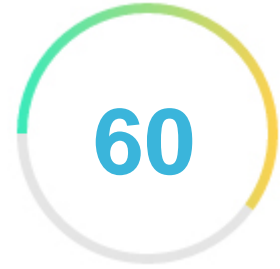
Your Website Score