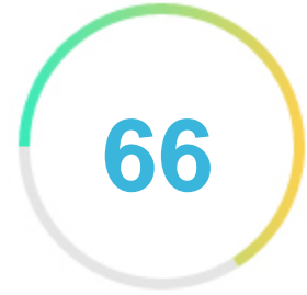
Your Website Score