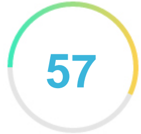
Your Website Score